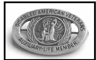
DAV Auxiliary life membership pin.

If by some chance you have missed the deadline for earning a free life membership pin, the silver-tone pins can be purchased from national headquarters at a cost of $15.00 each. We also have gold-tone pins of the same design available for $25.00 each.